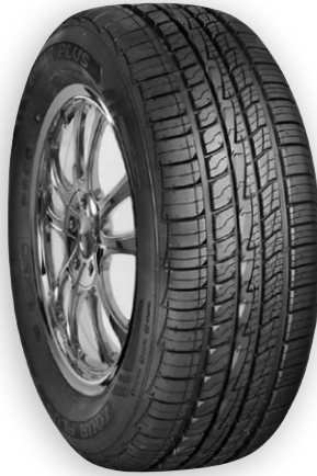
Tour Plus LST/LSH/LSV