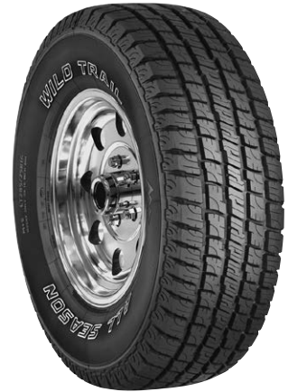
Wild Trail All Season