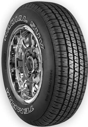
Tempra Radial SUV