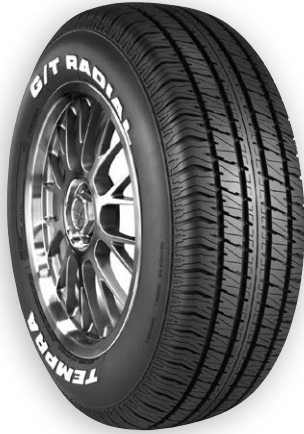
Tempra GT Radial