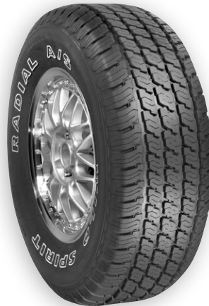
Wild Spirit Radial AS