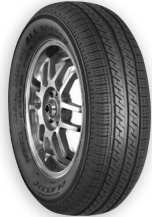
Classic All Season