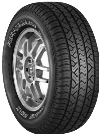
Grand Prix Performance GT